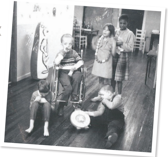
First five people who received services at Dawn of Hope.

Dawn of Hope is a very distinctive name, and it could indicate a number of different missions which non-profits might embark. But let me paint the picture for you in 1968, so that you can better relate.