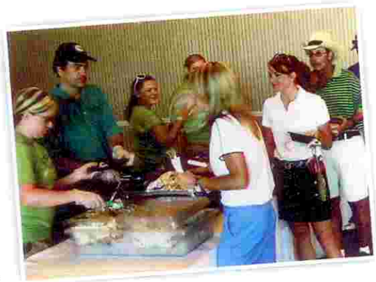
Players enjoyed a great