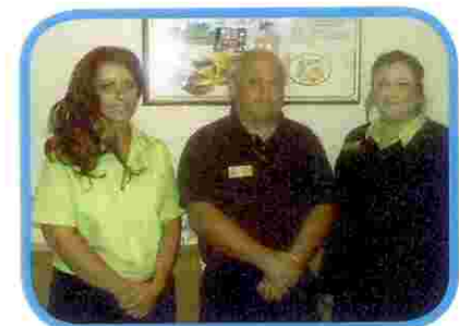
Thank you to the local Wendy's management for their help in changing lives.